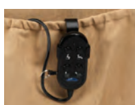
Four button handset